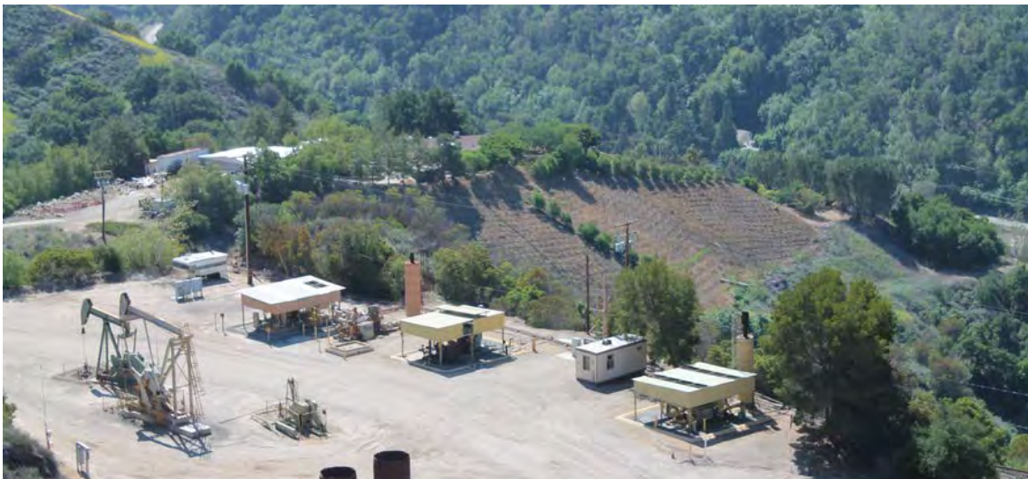
Upper Ojai, California. Though the area is predominately rural, oil and gas contribute substantial emissions in a county already exceeding ozone levels set by the state.

The predominant winds in the Upper Ojai area vary. Because of Upper Ojai’s location, winds may blow from every direction. 50 Due to the continually changing wind patterns, residents cannot avoid any odors from oil and gas facilities that blow into their homes.