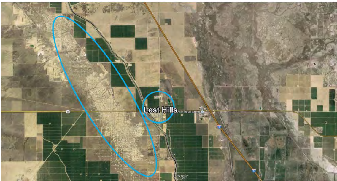
Lost Hills, California. The Lost Hills oil field, circled in blue is directly to the west of the community, also circled in blue.

The major limitations that emerge from the research include the concentration of the pollutants in the environment, the frequency and duration of exposures experienced by individuals, and potency of pollutants from oil and gas development.