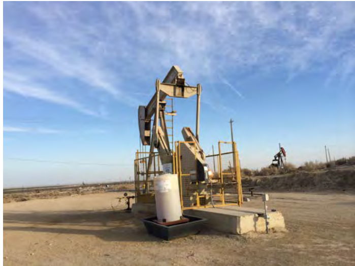
Pump jack in Kern County.

As long as oil and gas facilities function, communities will be at risk. Monitoring and long-term scientific studies are necessary while these facilities are operational. It is important to consider a multi-faceted approach to solve the problems facing California's communities because of oil and gas development. Proper scientific studies, comprehensive monitoring, involved grassroots communities, and regulatory agencies that fully protect citizens, can lead to a prosperous future premised on protection of public health and the environment.