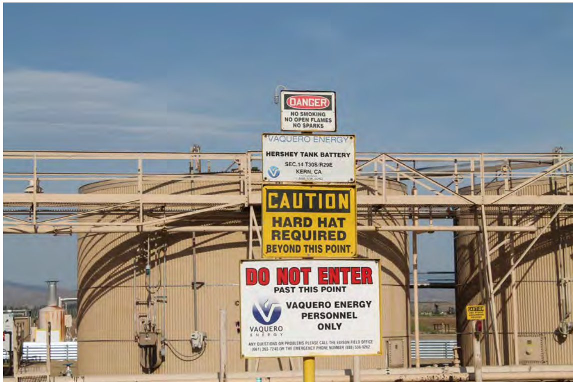
Storage tanks are typical sources of VOC (Volatile Organic Compound) emissions.

Finally, the data collected in the surveys served to obtain initial exploratory information for follow up studies. It was not meant to obtain a representative sample nor to establish statistical validity. The project did not investigate additional factors that can influence health conditions or cause symptoms, such as those included in assessments conducted using control groups in non-impacted areas or investigations into the comparative health histories of participants. Although important, that type of investigation exceeded the resources available for this assessment.