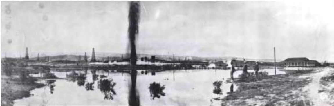
Lakeview Gusher, Kern County, California 1910.

Production has been steadily declining since hitting a peak in the mid 1980's; however, the use of unconventional stimulation techniques has caused increases in production in some fields. 8 Kern County has the largest and most productive fields, providing nearly 80% of all oil produced in California. 9 Additional development occurs in Ventura, Los Angeles, Monterey, and Santa Barbara counties. Most production occurs onshore, although some offshore production also takes place.