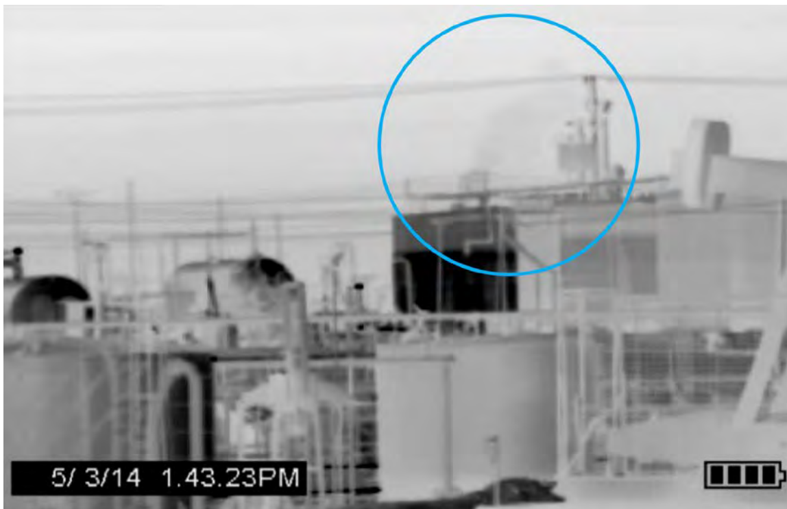
Emissions rising from a processing facility in the Lost Hills oil field. Note the blue circle indicating a plume. These emissions cannot be seen without the assistance of the FLIR infrared camera.