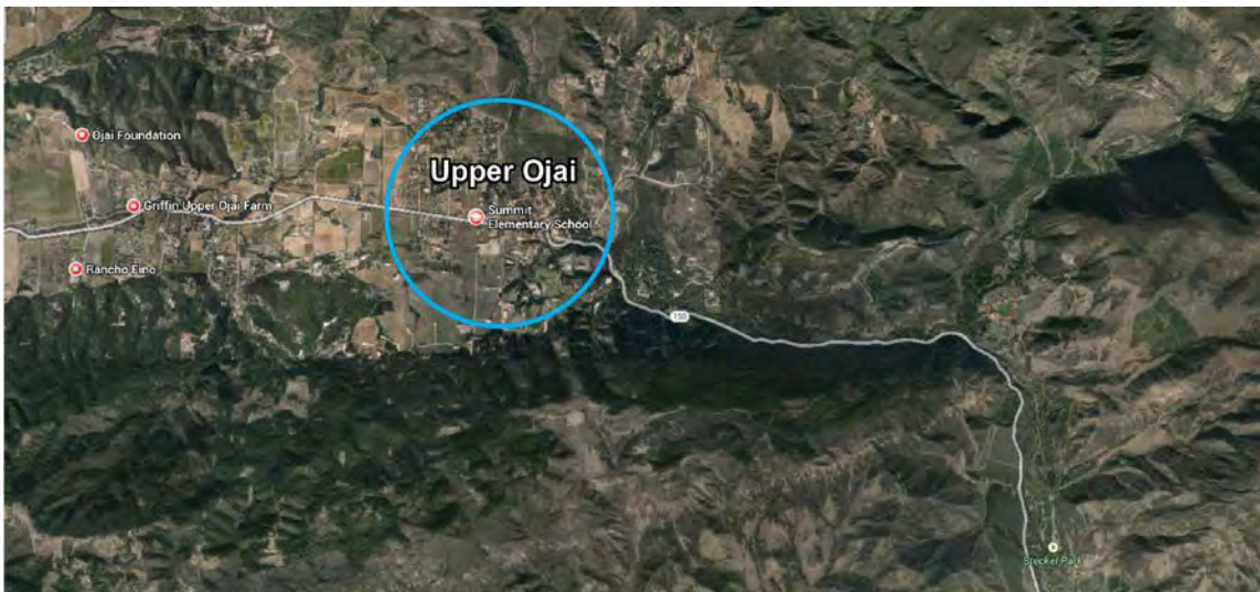
Upper Ojai, California.

Upper Ojai is a rural unincorporated community east of the City of Ojai, in Ventura County. The community is located on State Route 150, between Ojai and Santa Paula. The climate in the area is considered to be Mediterranean, with hot, dry summers, and mild winters. Precipitation averages 21" per year, with most of it falling between November and April. 40 On the map below, the community of Upper Ojai surrounds Summit Elementary School.