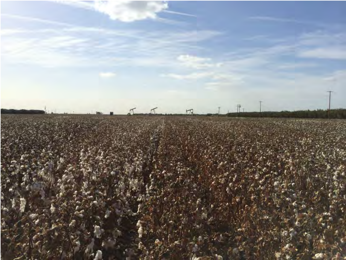
Cotton fields bordered by pump jacks, Kern County.

All respondents, except one, have been living in these communities for at least a year, allowing time for exposure to air contaminants that arise from oil and gas production. Although a complete picture of community-wide impacts cannot be obtained due to the number of surveys collected, the information begins to fill some of the data gaps that exist, helping residents identify a potential source of the negative health impacts they are suffering.