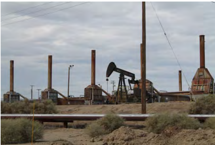
At the same processing facility taken on the same day within minutes of the picture above, emissions are invisible without the FLIR camera.