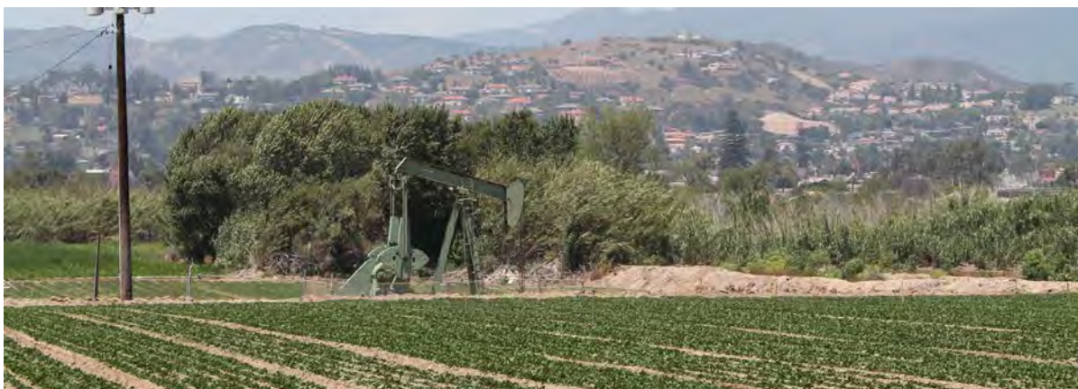
Pump jack in a field in Ventura County.