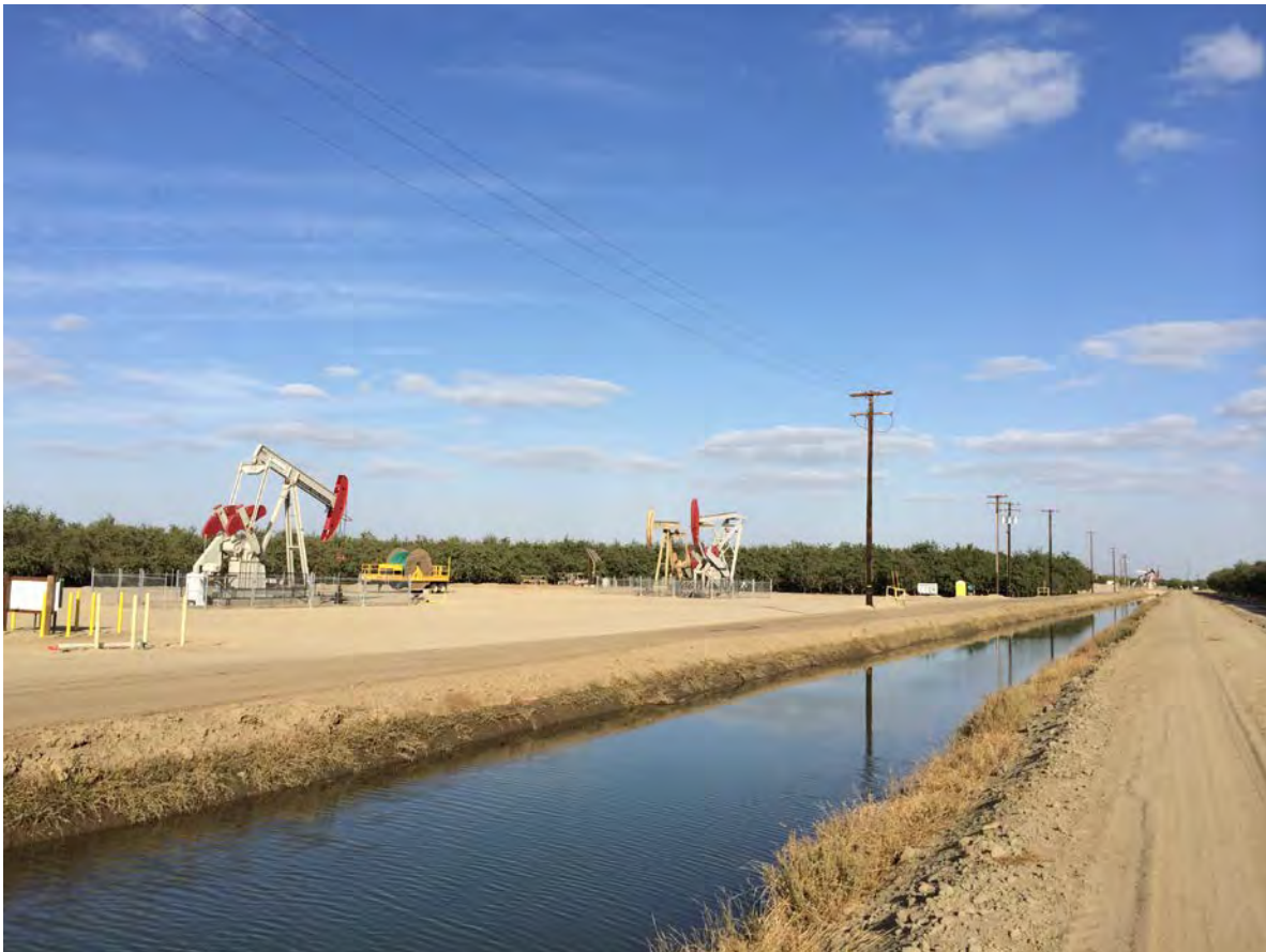
Kern County irrigation canal and almond groves.