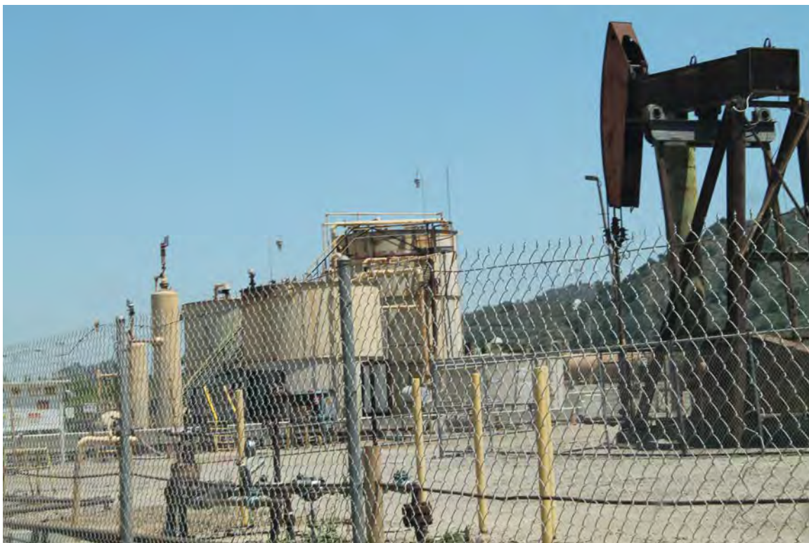
Pump jack and tanks, Ventura County.

Table 5 represents the categories and percentage of the participants who identified as suffering from health symptoms in those categories in Upper Ojai, based on the total of 13 surveys collected.