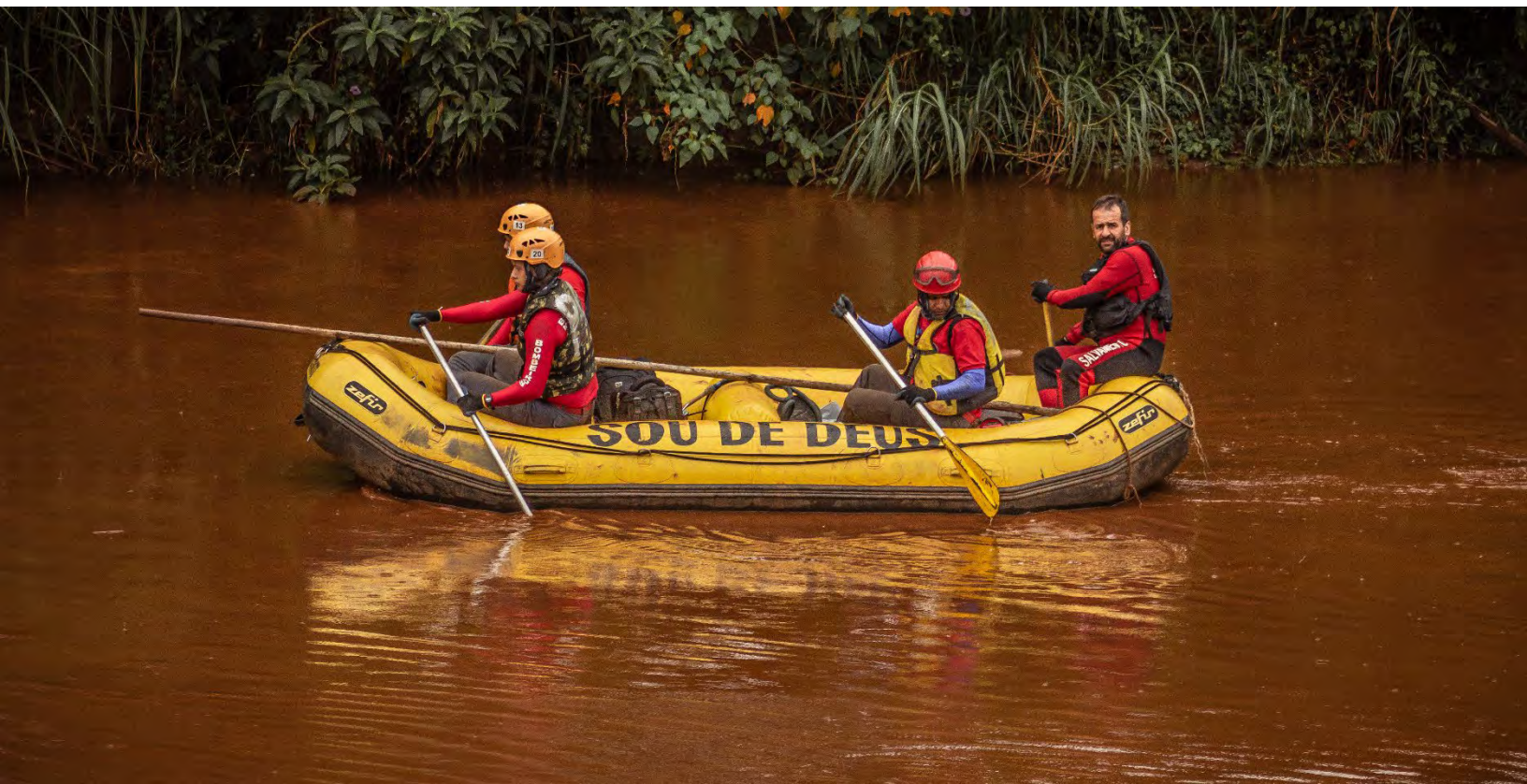
Contamination of the Paraopeba River after the 2019 tailings dam collapse near Brumadinho, Brazil.

Worst-case tailings failure scenarios must be modeled and made public prior to permitting and regularly updated throughout the facility lifecycles. Worst-case scenarios must model the complete loss of stored tailings and water, as occurred, for example, in the failure of the tailings dam at the Córrego do Feijão Mine in Brazil. Emergency and evacuation drills related to catastrophic failure of tailings facilities must be held on an annual basis, and its planning and execution should include participation from affected communities, workers, local authorities and emergency management. The operating company must report to stakeholders on tailings facility management actions, monitoring and surveillance results, independent reviews and the effectiveness of management strategies.